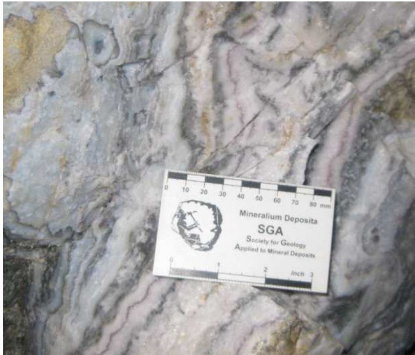
Fig. 4 Typical Banded texture from the San Carlos Vein, some of the dark bands are galena and sphalerite with some minor Ag Sulfides.