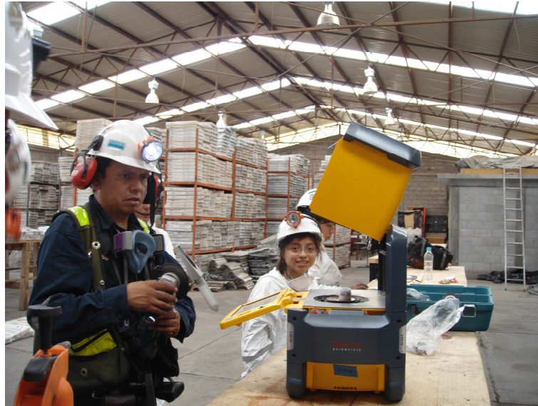
Fig. 6 Peñoles staff showing to the Student Chapter an XRF Niton device, for quantifying metal content in several core samples.

Historical production up to 2005 is 9.6 Mt of ore containing 4.74 MOz silver, 30.28 Kt of lead and 309.7 Kt of zinc with a plant capacity of 7000 tons per day, cut off grades have been changing according to price variability of Zn and Pb. Up dated reserves would give the Francisco I. Madero mine 18 years of living with out making any significant discovery (Figure 5 and 6).