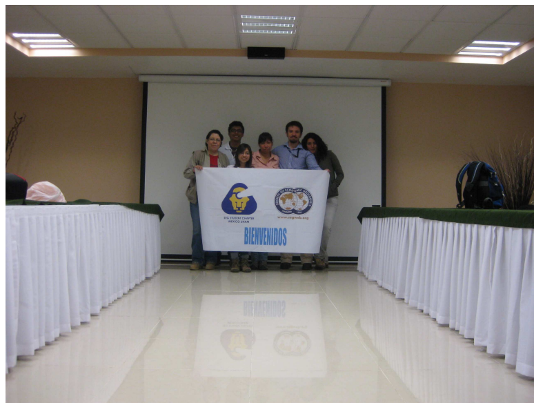
Fig. 7 Participants from 1 st Student Chapter Mexico UNAM.