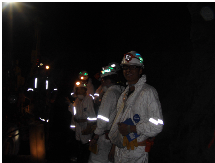
Fig. 5 Student Chapter members to see drilling techniques.

Francisco I. Madero it's a newly found deposit classified as a VMS Zn-Cu-Pb-(Ag) type according to the exploration model given by Mexican Geological Survey ( Consejo de Recursos Minerales and Peñoles Exploracion ). The genesis of this deposit has been controversial, evidences for a distal skarn model have been proposed based on mineralogical data (Canet et al. , 2009, for further reading). Both dikes of dacitic composition and ore stratification in massive aggregates were seen in the mining works.