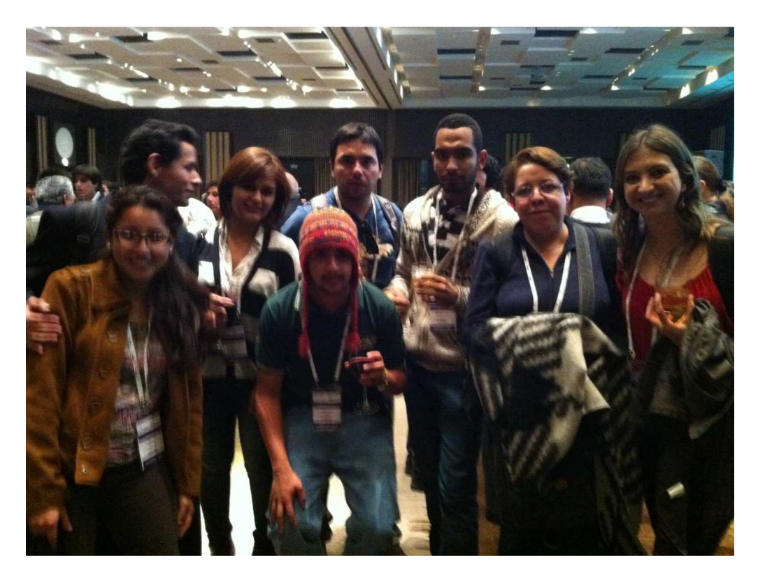
XVI Peruvian Geological Congress & SEG 2012 Conference in Lima, Peru